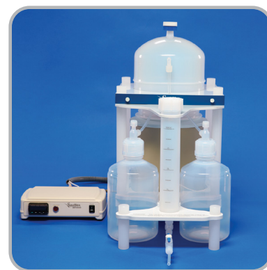
Front View of DST-4000 Acid Purification System