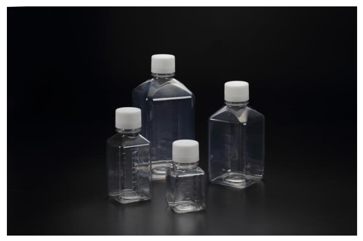
SPL PET Square Media Bottles

These heavy-duty containers include a high-density polyethylene (HDPE) lugged closure, which is engineered to provide a leakproof seal and sub-zero crack resistance. They also feature easy-to-read molded-in graduations.