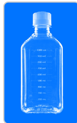
Purillex PETG Square Media Bottle, 1000 mL

They are ideally suited for use in a variety of critical applications in media manufacturing, research, drug development, and biopharmaceutical production, and are manufactured 100% in the USA.